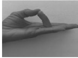
sharpen mind, center, prepare

Warm-Up hand exercises Stroking Squeezing Tapping