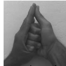
creation, rt brain