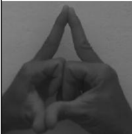
Hvn n Earth