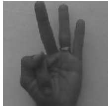
wisdom, hi chakras